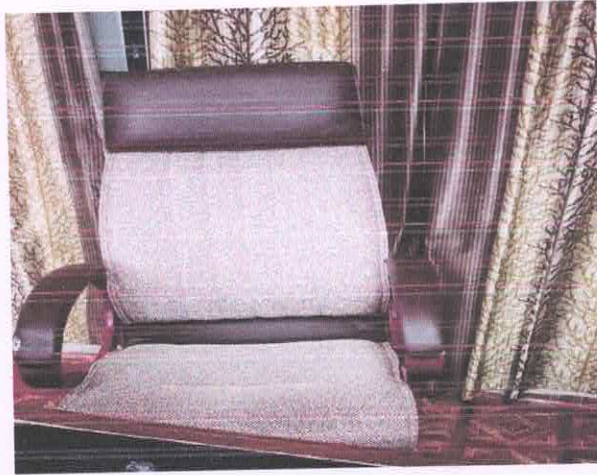
Fig: 1 Executive Chair to the College