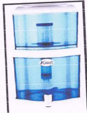
Fig: 1 Water Filter to the college