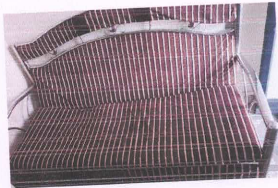
Fig: 1 Sofa set to the college