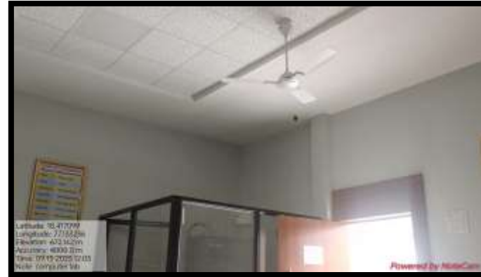
CCTV Computer Lab