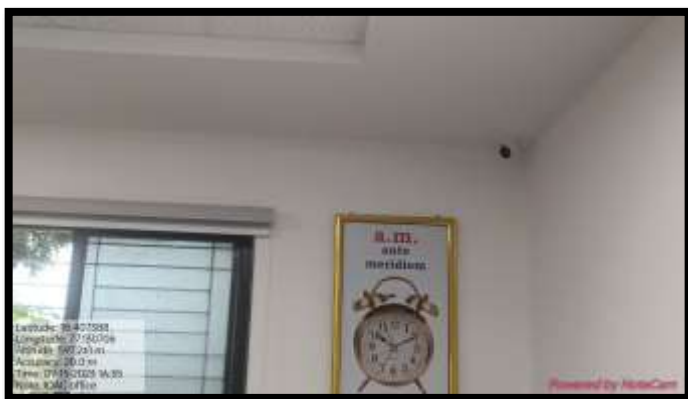
CCTV at Administrative Office