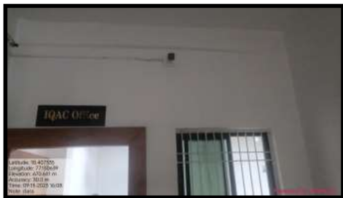
CCTV Outside the IQAC Office