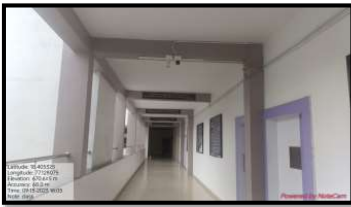
Office CCTV Corridor