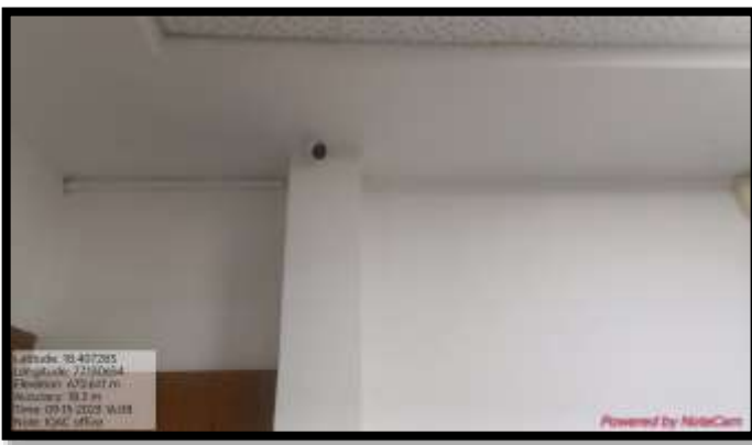
CCTV Inside the IQAC