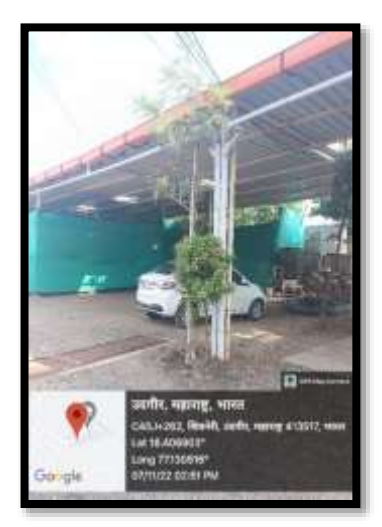
Rain Water Conduction PVC Pipes