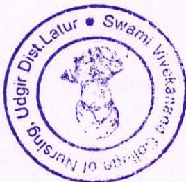
Principal Swami Vivekanand College of Nursing, Udgir Dist. Latur